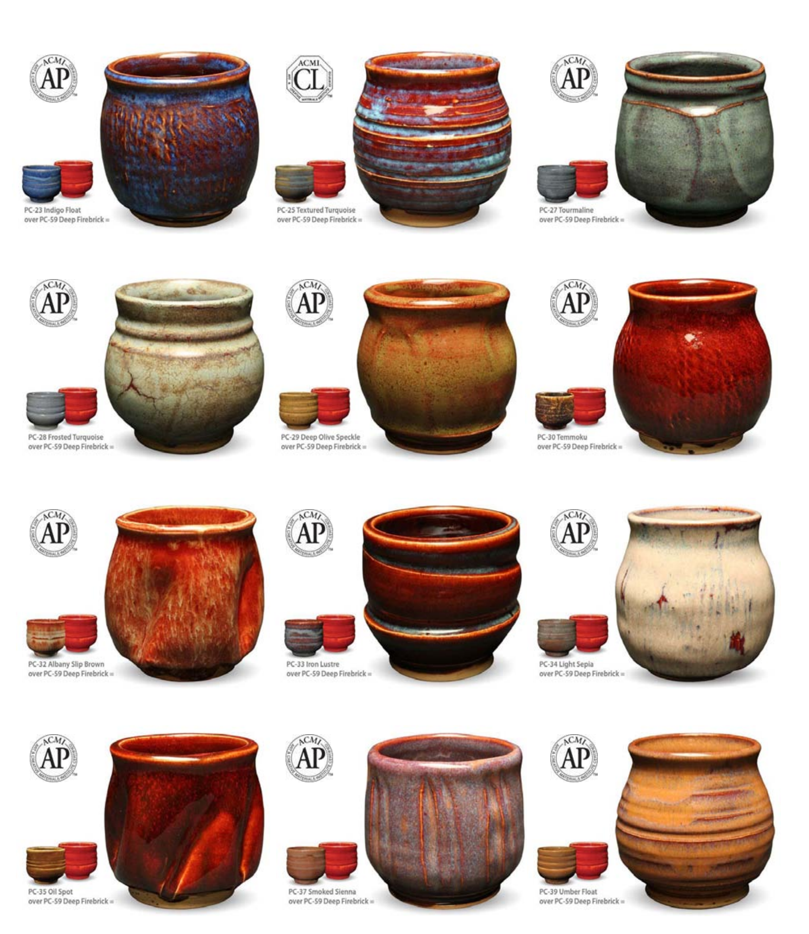
Learn more at LayeringAmacoGlazes.com