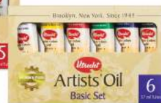
Basic Color Set 02123-1019