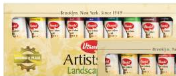
Landscape Set 02123-1049