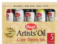
Color Theory Set 02123-1029