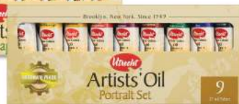
Portrait Set 02123-1059